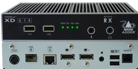
ADDERLink XD614 RX - Front & Rear

CAT6 is recommended for CATx extensions. CATx extensions are limited to 2 patch connections. Patch cables should be CAT6 or better.