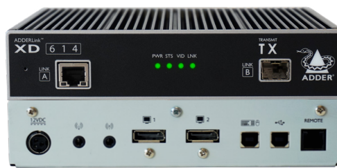
ADDERLink XD614 TX - Front & Rear