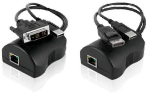
Pictured above: DDX-CAM-DVI (DVI Computer Access Module) DDX-CAM-DP (DP Computer Access Module)

System administrators can securely access the DDX30 management tools to configure system settings, set access privileges and control video connections. The interface is secured using HTTPS & administrators must login each time they connect. An API enables switch control from a 3rd party control system.