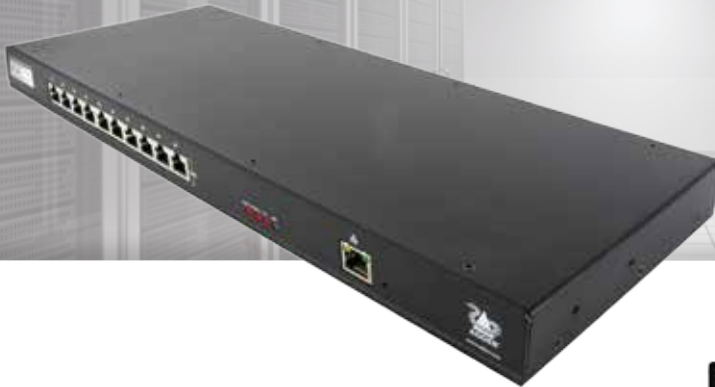
19 inch rack mountable KVM switch, DVI, DisplayPort, USB and audio