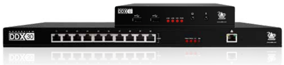
Pictured above: AdderView DDX30. Central KVM matrix switch AdderView DDX USR. User module (receiver)

For each additional break/patch connection reduce distance by 5 meters. Preferably patch cables should be of type CAT6 and less than 2 meters. Patch cables over 2 meters must be CAT6.