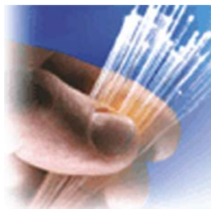
Fiber makes extended distances easy to reach

All models are available with both transmitter and receiver KVM access. The transmitter's KVM access allows an additional KVM station to be connected to the transmitter unit. If your system requires dual video, the CrystalView DVI Fiber dual video model can fully support it.