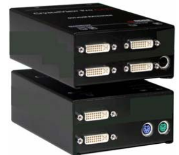
CrystalView DVI Fiber (Dual video model)