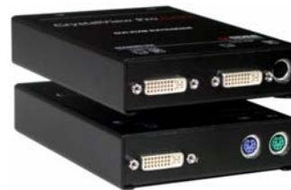
CrystalView DVI Fiber (Single video model)