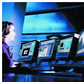
View single, dual, and quad video 1,000 feet away

The bi-directional serial option allows you to connect a touchscreen, digital tablet, serial printer or other supported serial device to the remote location. No set-up is needed; just connect the serial device to the serial port and it's ready to use.