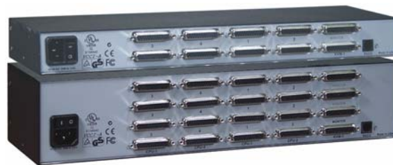
Rear View - MPB-4U2V (top) / MPC-4U4V (bottom)

■ Phone: 281-933-7673 ■ E-mail: sales@rose.com ■