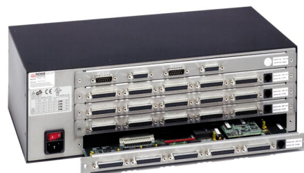
Rear View of UltraMatrix 4X, model UM4-4X16U/E

ROSE ELECTRONICS - US HEADQUARTERS 10707 Stancliff Road ■ Houston, Texas 77099 ■ USA Tel 281-933-7673 ■ Tel 800-333-9343 ■ Fax 281-933-0044