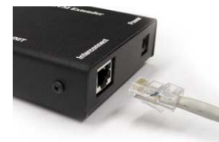
CrystalView Mini connectivity is virtually plug & play

ROSE ELECTRONICS - World Headquarters USA TEL 281 933 7673 or sales@rose.com