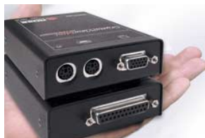
CrystalView Mini is small enough to fit in the palm of your hand

The CrystalView Mini extender is available in single and dual and offers distance capability up to 150 feet. The dual version allows an additional KVM station to be placed next to the computer, providing operation from either the remote or local location. For greater distances ask about CrystalView Fiber and other CAT-5 solutions.